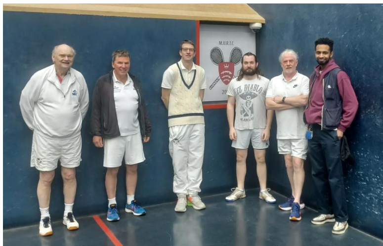
Teams away at Middlesex